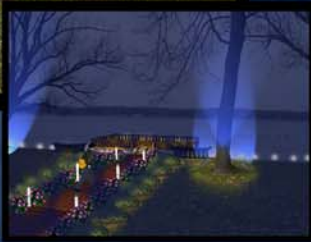
Deck Night Time