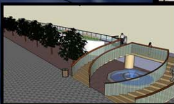
Fountain in the parking lot