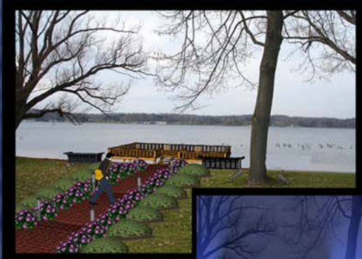
Deck Day Time