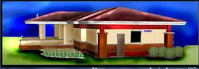
Restroom and ticket office

Natural Beauty Attracts People Into The Town